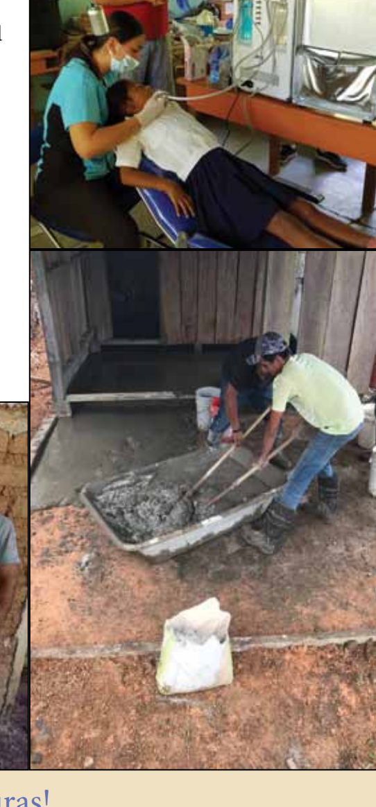
Help Us Send Supplies to Honduras!