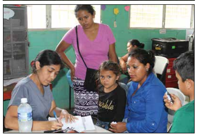
The community brigades bring necessary medical attention to poor, rural communities of Honduras. In addition, children found with malnutrition are invited to the Nutrition Center for care.